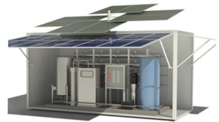
Compact and Modular Solutions

After 10 years, you will see widespread deployment of NEWT products, including the smart phones of the water industry