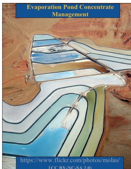
Evaporation Pond Concentrate Management