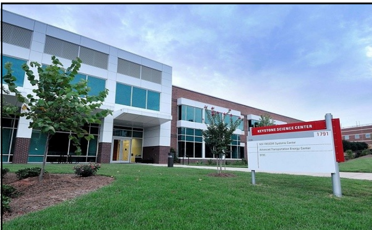
The Keystone Science Center