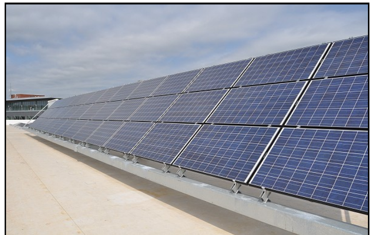
The FREEDM Systems Center's 40 kW Green Energy Hub Dedicated Solar Array